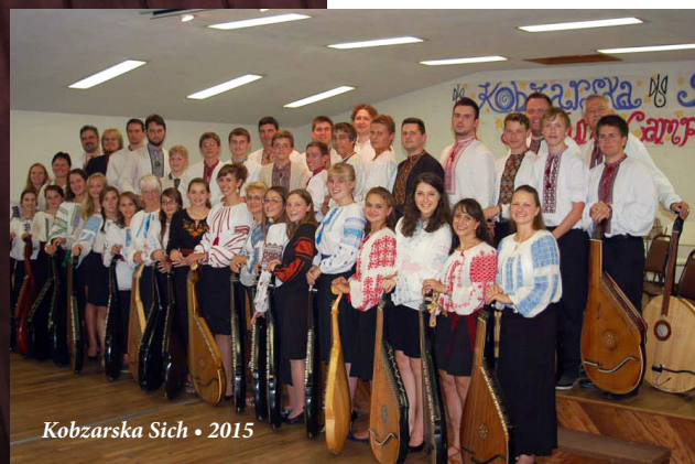
Kobzarska Sich • 2015

bandura players in today's UBC have graduated from Kobzarska Sich . Many more bandura players have gone on to form other ensembles. Kobzarska Sich offers multiple scholarship opportunities for aspiring bandura students, including a full scholarship available annually through the Ivan Zinchuk Memorial Scholarship Fund at the Ukrainian Canadian Foundation of Taras Shevchenko .