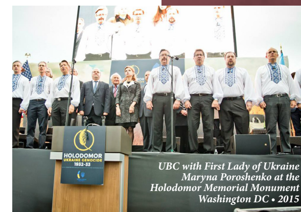
UBC with First Lady of Ukraine Maryna Poroshenko at the Holodomor Memorial Monument Washington DC • 2015