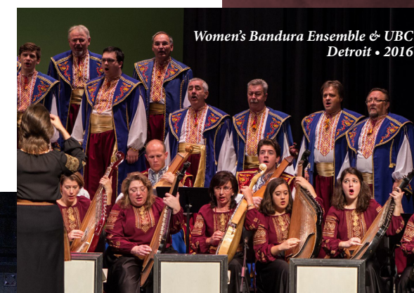
Women's Bandura Ensemble & UBC Detroit • 2016