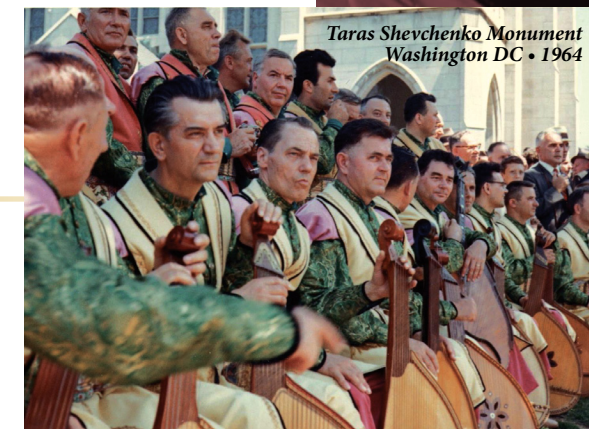
Taras Shevchenko Monument Washington DC • 1964

As a tribute to its role in preserving and perpetuating the legacy of Ukrainian music, the UBC was selected by Ukraine's Council of Ministers as the recipient of the Taras Shevchenko Ukrainian State Prize , the highest award that can be bestowed for excellence in the contribution to the arts.