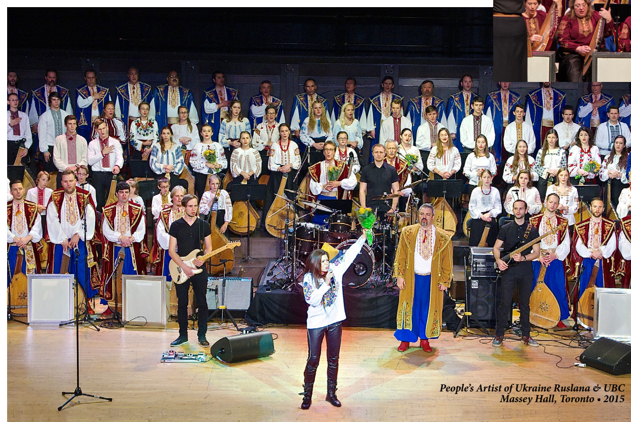
People's Artist of Ukraine Ruslana & UBC Massey Hall, Toronto • 2015